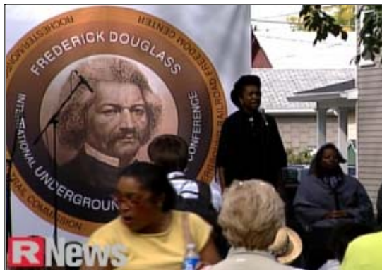
Frederick Douglass Freedom Festival